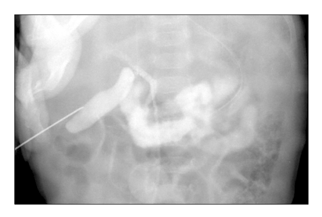
Fig. 2. Cholangiography at the time of operation after contrast showed patent gallbladder and common bile duct with good passage through duodenum.

despite gradual clinical and biochemical improvement on administration of omega-3 PUFAs for 3 weeks (AST/ALT, 96/60 IU/L; TB/DB, 2.7/2.4 mg/dL). Three weeks after admission, the patient underwent IOC, which revealed a patent gall bladder and common bile duct with passage of bile through the duodenum (Fig. 2). The bile was very thick, and irrigation with normal saline was performed. The stool subsequently became a definite yellow color (21st