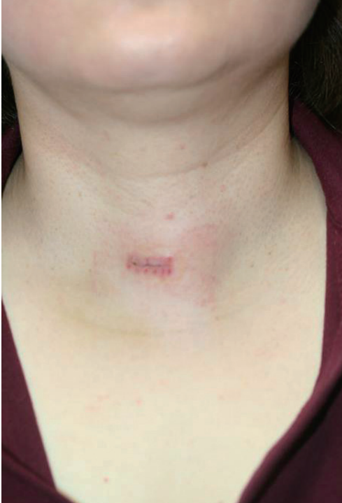
Fig. 2. The band-like scar tissue disappeared after surgery. The neck and chest moved separately.

Tracheal and soft tissue involving the dermis layer had adhered from the neck to the chest along the left approach track. After removing the scar tissue, the adhered site was covered with deep cervical fascia and subcutaneous fat tissue using an anti-adhesive agent. After surgery, the band-like scar tissue disappeared and symptoms improved (Fig. 2).