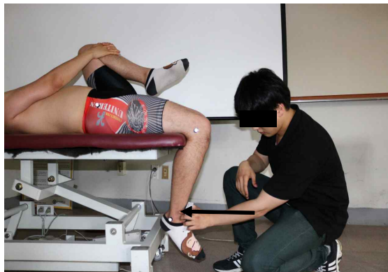
Figure 1. Passive knee flexion (PKF).

Prior to each testing session, reflective markers were attached at the following landmarks: in the greater trochanter of the femur (located 4-6 inches below the mid-point of the iliac crest), the fibular