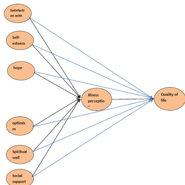
Figure 1. Path diagram: A Pictorial Representation of the Model

In the cases in which the patient was illiterate, was not able to read without wearing glasses or was not willing to read and answer the questionnaire thoroughly, the researcher had to read the questions and mark the answers by herself. On the whole, 176 questioners were reliable enough to be used in the study. It is noteworthy that before analysing any data, we made sure of the accuracy of the filled questionnaire by data screening in an attempt to reach this significant goal: Eliminating patients who left out more than 20% of the questions blank and eliminating patients who had the parallel answer patterns as well. The analyses were executed on 176 valid questionnaires. For the next step, we improved or removed outlier data. From the hypothesis of parametric data gathering, normal and homogenous nature was studied. Of course, since almost all of the data is in Likert scale and from the theoretical view is in ordinal scale, we took them into consideration. The final step in data screening has been replacing blank left out questions and to do this