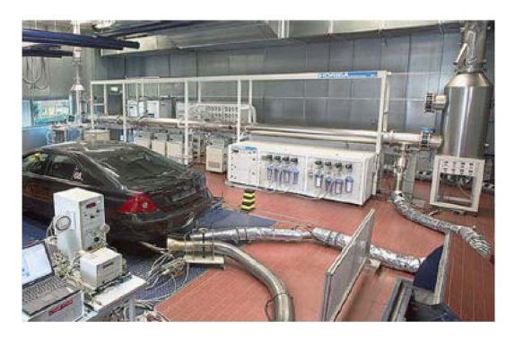
Fig. 1 Chassis dynamometer facility for measuring motor vehicle emissions

chassis dynamometer system has been used to investigate the characteristics of vehicle exhaust emission<sup>(25-26)</sup>. The chassis dynamometer facility is shown in Fig. 1<sup>(27)</sup>. Table 1<sup>(27)</sup> lists a variety of sampling media and chemical analyses included in such suites.