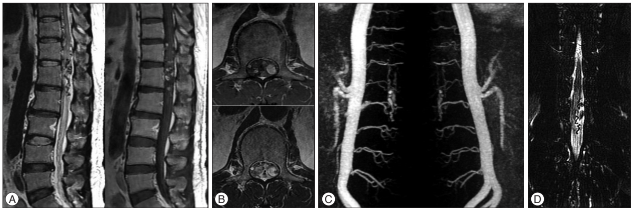
Fig. 1. Magnetic resonance imaging (MRI) of the thoracolumbar spine reveals abnormal lesions with signal void and enhancement, indicating a vascular anomaly at the T12, L1, and L2 levels (A). Axial images at the L1 level show a left-sided mass lesion in the spinal canal (B). Three-dimensional volumetric contrast-enhanced sagittal TRICKS abdominal magnetic resonance angiography (MRA) using 1.5T MRI system was performed. The study was post-processed into maximum-intensity projection images. These images show a feeding artery at the L1 level (C). Magnetic resonance myelography (anterior-posterior view) reveals a left-sided vascular anomaly (D).