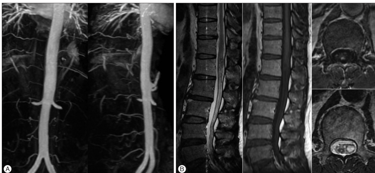
Fig. 4. Follow-up MRI and MRA images after 3 years show disappearance of the feeding artery of the spinal dural arteriovenous fistula (A) and sequelae of the previous lesion (B).