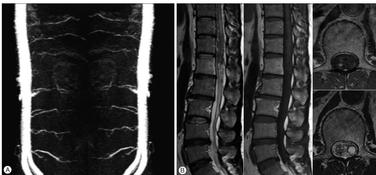
Fig. 3. Follow-up MRI and MRA images after 7 months. The size of the feeding artery and abnormal vascular lesion is decreased (A). The previous lesion with signal void and enhancement is also reduced (B).

Selective spinal angiography is regarded as an essential procedure to confirm and treat SDAVF 5 . For successful surgery or endovascular coiling, selective spinal angiography is necessary to know the architectures and hemodynamics of the lesion 5,6,12,15,18,19,22 . However, even with experienced neuro-interventionists, selective spinal angiography can sometimes cause complications from vasospasm, increased venous pressure, and spinal cord infarction 6,8,12,15,17,20 . In our case, the patient experienced paraparesis three times during spinal angiography. Although it occurred 14 years previously, the patient refused the spinal angiography. Because the patient wanted a noninvasive method for diagnosis and treatment, we found an imaging technique to provide information about the lesion and be available for follow-up. There