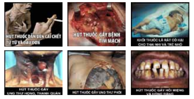
Figure 2. Pictorial health warning printed on cigarette packages in Vietnam since May 2013. From left to right, up to down: (1) Smoking leads to death slowly and painfully; (2) Smoking causes heart diseases; (3) Cigarette smoke is very harmful to fetus and young children; (4) Smoking causes throat and laryngeal cancer; (5) Smoking causes lung cancer; (6) Smoking causes bad breath and damaged tooth

As a result, WHO classified Vietnam as having the highest achievement on W-Warn about the danger of tobacco use in MPOWER package (World Health Organization, 2015a).