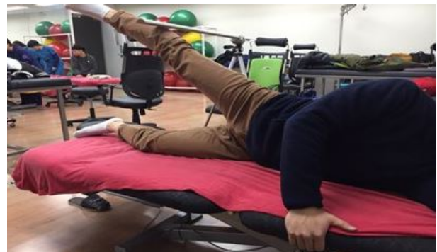
Figure 1. Position inducing fatigue on the gluteus medius.

Values are presented as number only or mean (SD). RM: repetition maximum, BMI: body mass index.