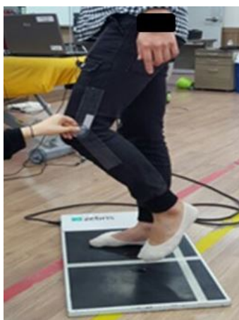
Figure 2. Measurement of static balance.

Although the COP distance was greater after fatigue was induced, there was no significant increase. Although there