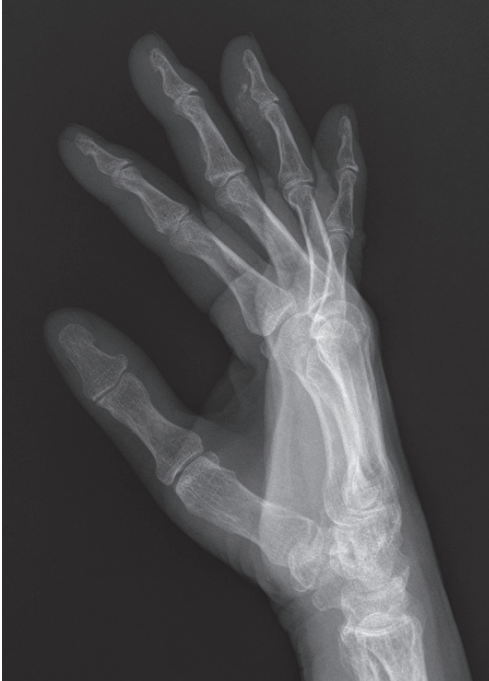
Fig. 4. Follow-up radiographic findings after two months showed the spontaneous resolution of the calcification.

appearance of the calcification had become mottled (Fig. 3), and the patient's C-reactive protein level decreased gradually. After one week of treatment, the patient experienced a complete resolution of pain and exhibited a full range of motion without difficulty. Follow-up radiographic findings after two months showed spontaneous resolution of the calcification (Fig. 4) [5].