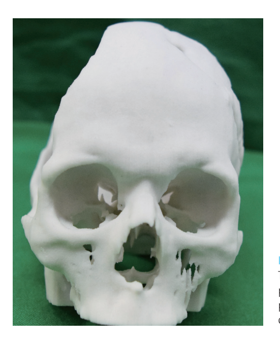
Three-dimensional (3D) printing model of the patient was made using a 3D computed tomography scan.