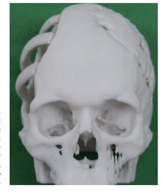
Fig. 3. Three-dimensional (3D) model was used to determine the minimum amount and portion of rib that would also be the most ideal aesthetically. After determining the ideal portion, a cranioplasty simulation was conducted using the 3D model.

a plan was devised to perform a split-rib autologous graft. In order to harvest the portion of rib bone with precisely matching curvature, a rib and skull model was printed from preoperative 3D-computed tomography (CT) scans of the patient using 3D printing technology (Fig. 2). The machine used for 3D printing in this study's case was 3D Systems ProJet 660Pro. This is not a model constructed for medical use, but rather a machine used mainly for the making of ordinary commercial test products. After