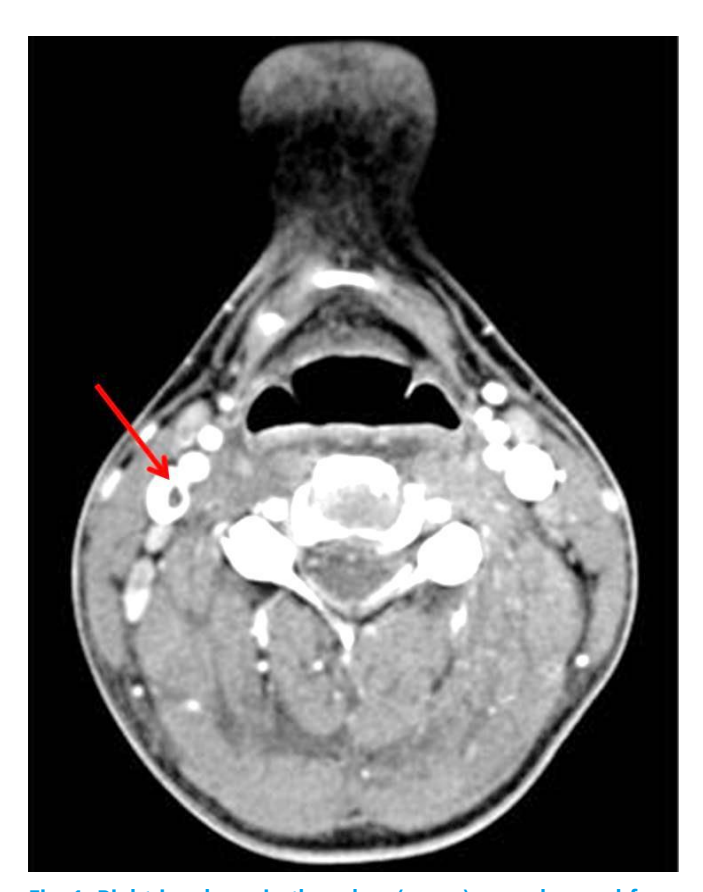
Fig. 1. Right jugular vein thrombus (arrow) was observed from the intracranial portion to the fourth C-spine level with patent blood flow.

Fever subsided on the sixth day after admission, which meant he had maintained a ten-day-long fever. On the