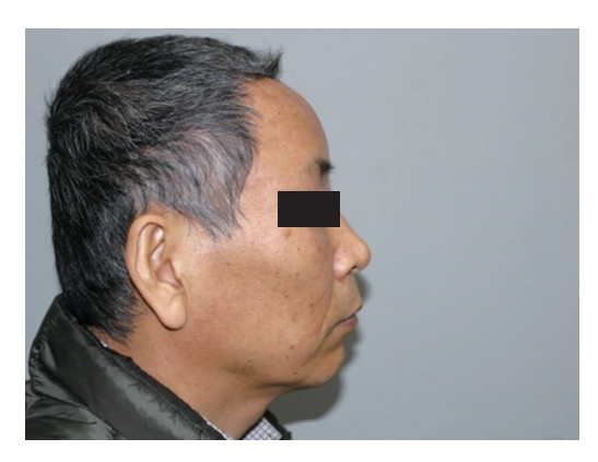
Fig. 3. Fat grafting was helpful for decreasing the visibility of the scar and contour irregularity.

fixation of the frontal sinus anterior wall, maintenance of sinus function preserving the continuity of nasofrontal duct drainage, and sinus obliteration (with a broad range of matters). Some complicated cases of frontal sinus fractures may require sinus cranialization; however, the benefit of cranialization was controversal [27]. Clinical and experimental evidence suggest that duct obstruction and/or remnant sinus mucosa due to inadequate obliteration are serious predisposing factors of infectious complications [28].