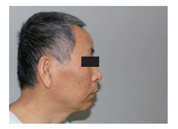
Fig. 2. In this patient with craniectomy and cranioplasty with Medpor, the right forehead has a conspicuous scar with depressed contour.