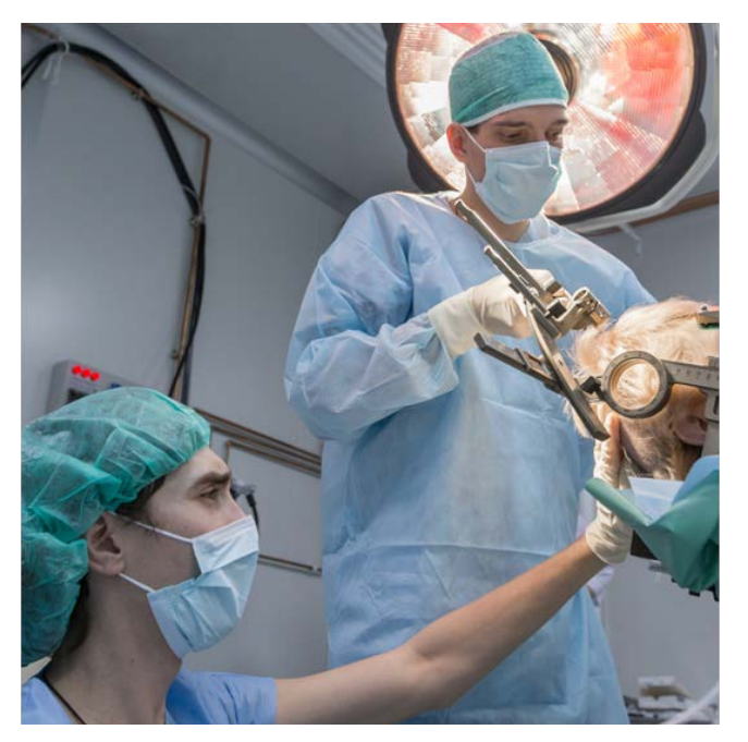
Fig. 2. Stereotactic brain tumor biopsy.