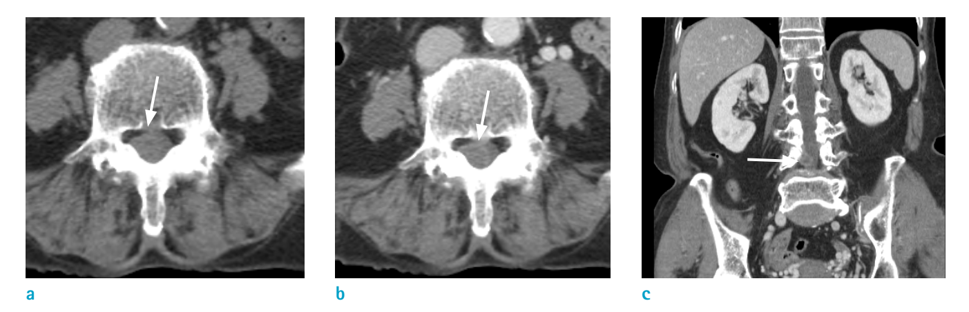
Fig. 2. A computed tomography image of the patient's abdomen and pelvis. (a) The precontrast image shows a subtle high-density lesion at L4 (arrow). (b) The postcontrast image shows no gross fatty lesion or a peripheral enhancing lesion (arrow). (c) The coronal image shows a peripheral enhancing lesion at L4 (arrow).