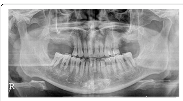
Fig. 1 Preoperative panoramic radiograph of 46-year male patient. Residual bone height is about 2–3 mm, and sinus radiopacity is observed in the right maxilla

A total of 51 implants (group 1 20, group 2 31) were placed, mostly with average waiting time of 6.22 weeks after sinus bone graft. Note, however, that implants were placed immediately after sinus bone graft for 13 cases (the period until the implants were placed was calculated by counting the healing period as 0 day in the direct placement method). The restoration was connected 29.41 weeks on the average following implant placement and after the radiographic view was taken. It was observed for an average of 43.29 months at an interval of 3~6 months after