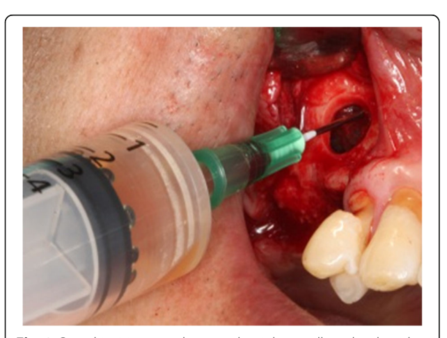
Fig. 3 Crestal incision was done on the right maxillary alveolar ridge, with the flap elevated. Mucous fluid was aspirated by opening the lateral wall of the maxillary sinus

The periapical views were taken vertically to the length of the implants to calculate and to compare the values of marginal bone loss. The distance from the platform of an implant to the first site meeting to crestal bone was measured, and the real distance was obtained by