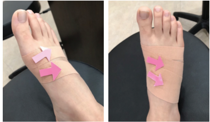
Fig. 4. Taping therapy of the foot.

Acupuncture needles were inserted at six acupoints for 10 minutes on the left foot: GB41 (足臨泣), GB40 (丘墟), BL62 (申脈),