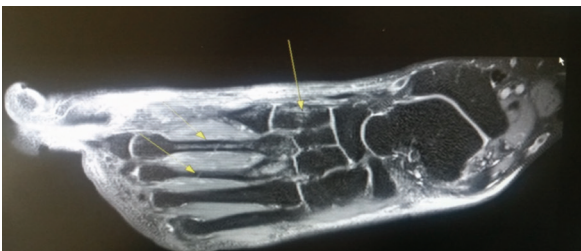
Fig. 3. Magnetic resonance imaging on December 12, 2016 showed bone marrow edema at the medial cuneiform bone.

revealed Lisfranc joint injury and fractures of the first, second, and third metatarsals and a cuneiform bone (Figs. 2 & 3). On December 13, 2016, he underwent surgery (fixation of K-wires and screws). On March 10, 2017, the K-wires and screws in the metatarsals and medial cuneiform bone were removed. However, as the patient continued to experience persistent left foot pain, he visited a Korean medicine hospital and received a total of 23 outpatient treatments from March 24, 2017 to May 4, 2017. Before his treatment at the Korean medicine hospital, the patient provided written informed consent for his case details and photographs to be used in this report.