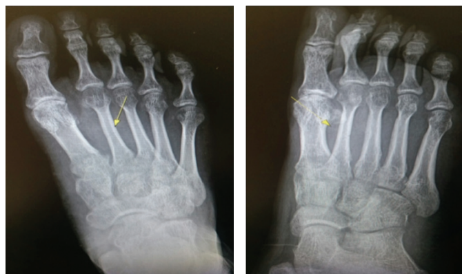
Fig. 5. X-ray images taken on May 2, 2017.

Lisfranc joint injuries are frequently caused by external damage. There may only be ligamentous injury, but if there is also direct bone injury, then it is easily diagnosed at the initial stage [7,8]. However, when the ligamentous complex is also damaged or a bone is injured alone, missed diagnosis or misdiagnosis can occur and lead to chronic pain and walking disorders after convalescence [9-11]. Open reduction and internal fixation are generally