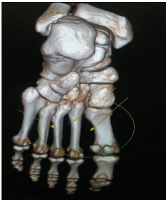
Fig. 2. Computed tomography on December 12, 2016 revealed cortical fracture at the base of the first metatarsal bone.