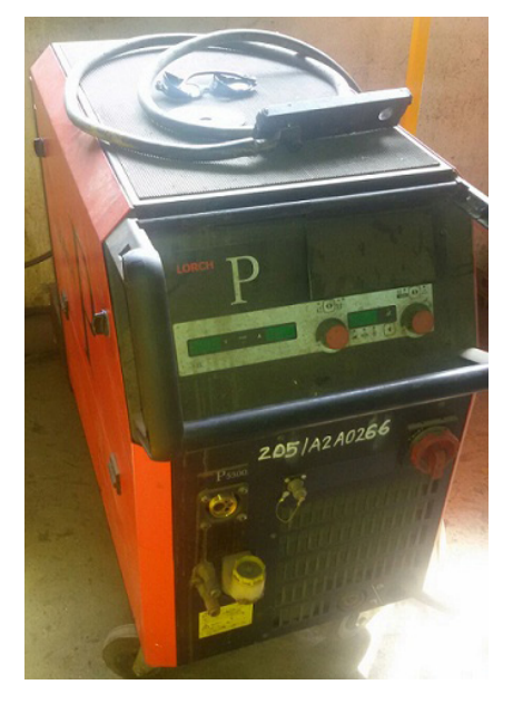
Fig. 1 Photographic view of GMA welding machine

speed. The objective of this study as discussed earlier is to optimize the welding process parameters for enhancing weld penetration. A total of the three welding process parameters were chosen as the controlling factors.