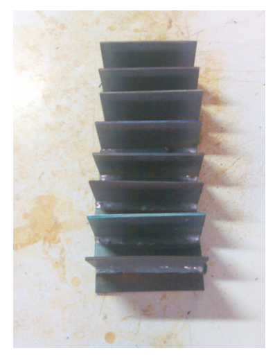
Fig. 2 Sample preparation

ation already saved program can be used and real time reports are generated in generic format.