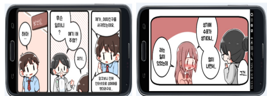
Fig. 2. Sample cartoon clips

Strategies we used to increase the attention duration of adolescents included use of cartoon clips and a private chat room. First, we developed the information on STI knowledge as cartoon clips (see Figure 2), based on true stories in order to gain viewers' motivation. Cartoon clips also provided STI-infection routes, STI symptoms, STI diagnosis, and STI treatments. Also, if adolescents had some sexual problems, they could receive counseling from an expert in sexual health. The private chat room is an interactive system that could compensate for the limitation of previous smartphone application educational programs that provide a one-way communication system.