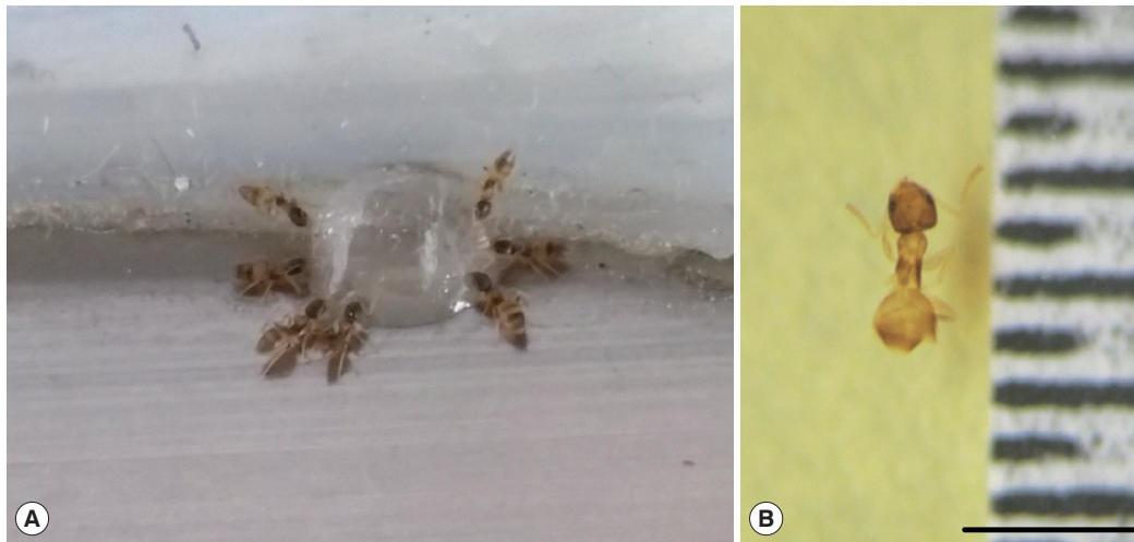
Fig. 1. Ghost ant ( Tapinoma melanocephalum ) workers. (A) T. melanocephalum at a bait trap with 10% sugar solution. (B) Dorsal view. Scale bar = 1 mm.

and the appendages, petiole, and gaster being milky white. The eyes were large, the antennae had 12 segments, the thorax was spineless, the gaster was hairless, and the abdomen had no stinger (Fig. 1B).