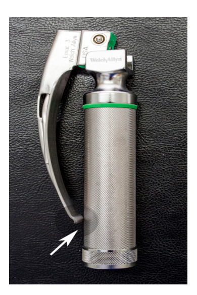
Figure 1. Photograph showing that the tip of the blade contacts an area on the knurled surface of the handle (arrow) when in the off position.

Two target hospitals and their emergency crash carts each included more than two laryngoscope blades and handles that were managed by nurses based on the same disinfection management instructions. The laryngoscope blade is disinfected using peracetic acid (Antec International Ltd., Suffolk, UK) or ortho-phthalaldehyde (Ethicon Inc., Irvine, CA, USA) from sedimentation, rinsed with distilled water, and dried. The handle is disinfected using disinfection wipes (Ebiox Ltd., Cheshire, UK).