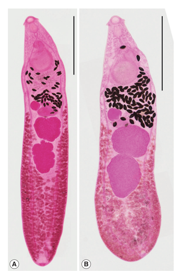
Fig. 2. Isthmiophora hortensis adults (Semichon's acetocarmine stained). (A) Normal slender. (B) Abnormal plump, recovered from a rat experimentally infected with metacercariae, which were collected form the Korean dark sleeper, Odontobutis platycephala , from Yugucheon (a branch of Geumgang) in Gongju-si, Chungcheongnam-do. Scale bar = 1,500 μm.

Among the worms recovered from an experimental rat at day