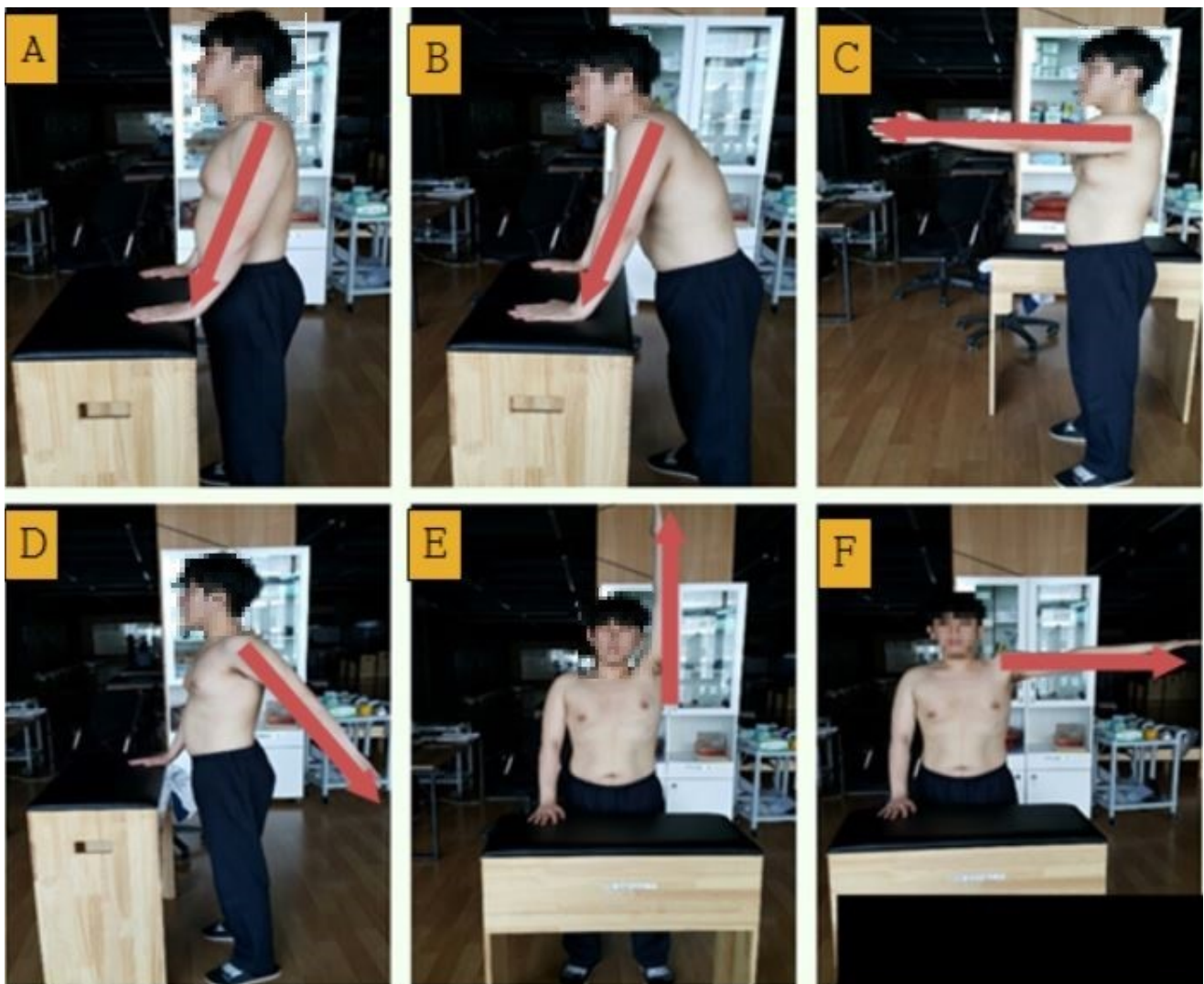
Figure 2. Upper extremity co-ordination exercise. Red arrow means affected side. (A) Bring the scapula to the center and place both hands on the table. (B) Supporting weight on the table. (C) Shoulder protraction of affected side upper limb. (D) Shoulder extension of affected side upper limb. (E) Shoulder flexion of affected side upper. (F) Shoulder abduction of affected side upper limb.

Briefly, participants received 30 minutes of strengthening exercise on UECE in standing posture. Exercise was conducted 3 sessions per week for a total of 4 weeks. Participants in the Control group (SUEE) received 30 minutes of shoulder movement exercise (flexion, extension, abduction, adduction, internal rotation, external rotation) in standing posture. All operations are simple, without special constraints, and allow compensation on the other side. All the participants in both groups received 30 minutes per ses-