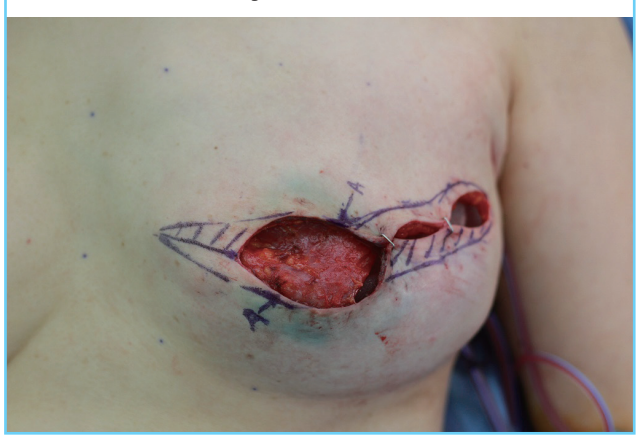
Fig. 3. Selection of the skin excision are:

Using the nipple-areolar complex (NAC) removal site (round shape) after skin-sparing mastectomy, a transversely laid fusiform excision design was drawn, on which the long axis was 3 times longer than the NAC diameter. The long axis line and excision area were marked.