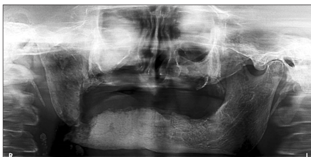
Fig. 1. Panoramic radiograph. Radiologic image shows a full-thickness right jaw fracture.

Due to systemic involvement, the patient was admitted to the ENT Department, where CT scan of the face, neck, and chest was performed without contrast medium, showing thickening of the soft tissue adjacent the inferior right hemimandibular surface; multiple bilateral abscesses in the upper cervical region, more evident on the right; and normal thoracic-mediastinal district, in addition to the right mandibu-