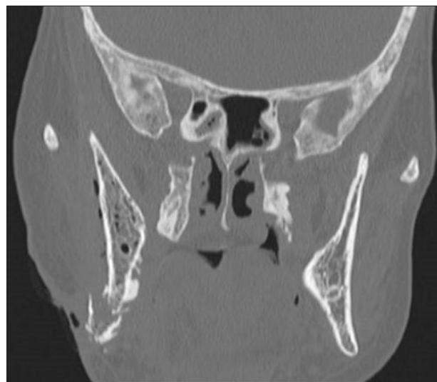
Fig. 2. Computed tomography scan of the head; coronal view. Coronal view shows bisphosphonate-related osteonecrosis lesions, fracture of right jaw and thickening of the soft tissue adjacent the inferior right hemimandibular surface in a 69-year-old woman with breast cancer history and treated with zoledronic acid for 23 administrations.

After initial clinical improvement observed about 4 days after cervicotomy, the patient's condition deteriorated sharply,