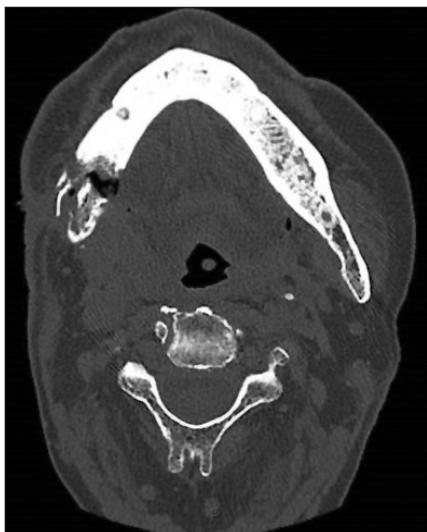
Fig. 3. Computed tomography (CT) scan of the head; transversal view. CT scan of the face, neck and chest was performed without contrast, showing pathological fracture of right jaw and periosteal reaction, besides mixed lytic and sclerotic lesion of the jaw. Massimo Viviano et al: A case of bisphosphonate-related osteonecrosis of the jaw with a particularly unfavourable course: a case report. J Korean Assoc Oral Maxillofac Surg 2017