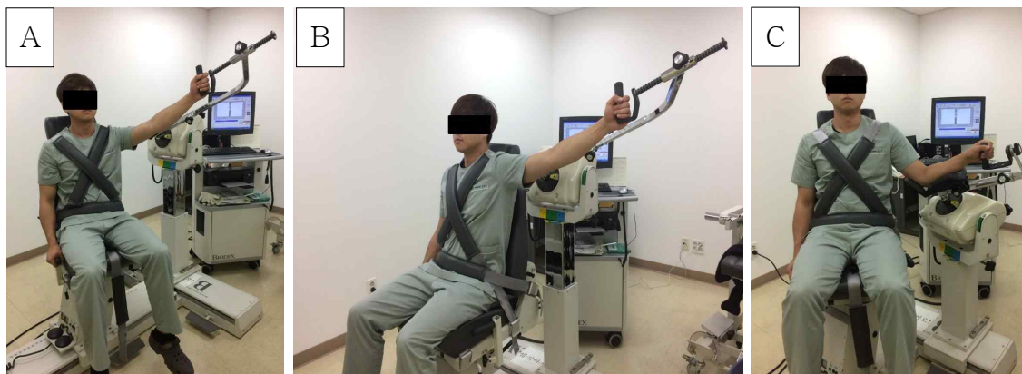
Figure 1. A: FLcon and EXecc, B: ABcon and ADecc, C: ERcon and IREcc (ABcon: concentric abduction, ADecc: eccentric adduction, ERcon: concentric external rotation, EXecc: eccentric extension, FLcon: concentric flexion, IREcc: eccentric internal rotation).

generating an eccentric flexion) (Figure 1A).