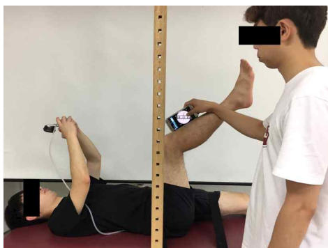
Figure 1. Active knee extension with PBU.

used to determine the settings of the PBU. All AKE tests using the PUB performed in this study were conducted according to the AKE test described by Gajdosik and Lusin (1983). A PBU (Pressure Biofeedback unit, HEALIENCE, Korea) was used to monitor lumbopelvic movement during the AKE test. The same PBU was used throughout the study to avoid between-device differences (von Garnier et al, 2009). To assure the exactness of the PBU measurements, the unit was pretested by loading the biofeedback unit bag for 24 hours with 4 kg. A unit is considered appropriate if the device loses no more than .5 mmHg during the 24-hour period (von Garnier et al, 2009). The accuracy of the apparatus was found to be \pm 3 mmHg (Storheim et al, 2002).