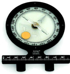
Figure 1. Inclinometer