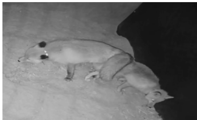
Fig 4. Male fox in mounting posture at the first step of mating. Fig 5. Tie posture, a typical mating behavior of Canidae