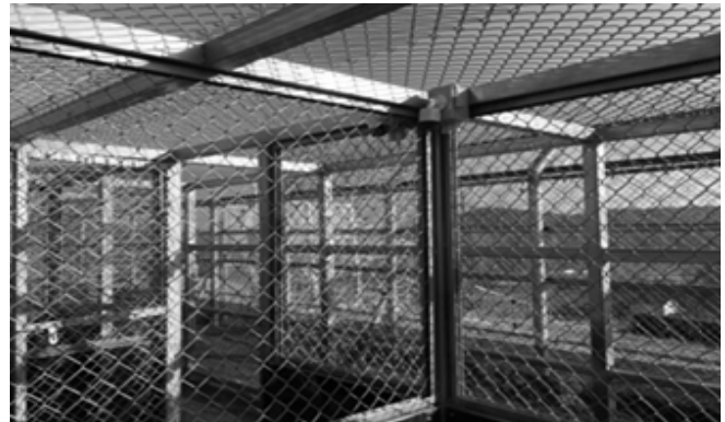
Fig 2. Monitoring system installed to observe fox mating in the outdoor breeding facility