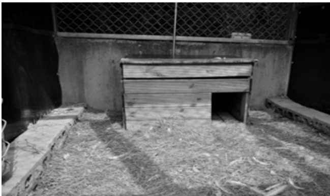
Fig 1. Interior of the outdoor breeding facility furnished with a wooden box

Mating data were collected for all females, except one, for which mating was not confirmed. Average and standard deviation ( SD ) data were calculated for each studied feature and significant differences were analyzed by t -tests, considering p < 0.05 as significant.