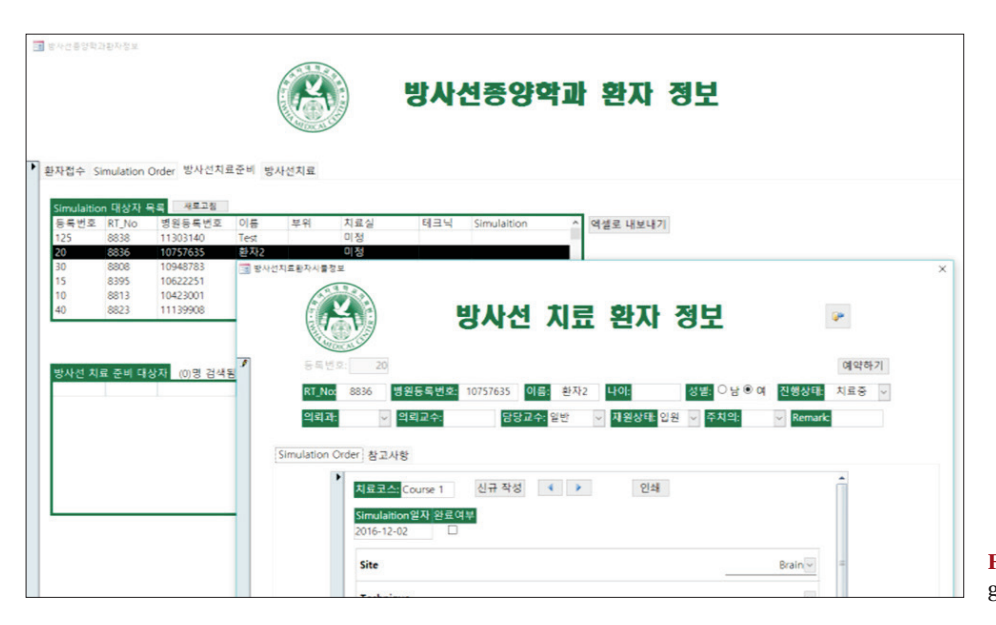
Fig. 4. Patient treatment plan management form.

The Radiotherapy tab consists of a list of patients scheduled to be treated, a list of rest subjects, and a list of patients undergoing treatment. The list of patients to be treated shows a list of patients who have completed their radiotherapy preparations and have not yet started treatment. The list of Rest subjects shows the list of patients who have been in rest therapy during radiotherapy. The