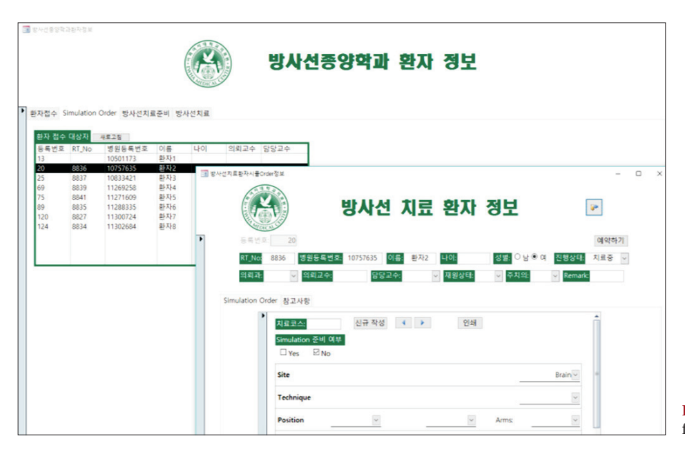
Fig. 3. Simulation order and manage form.

When the simulation prepared, the treatment schedule