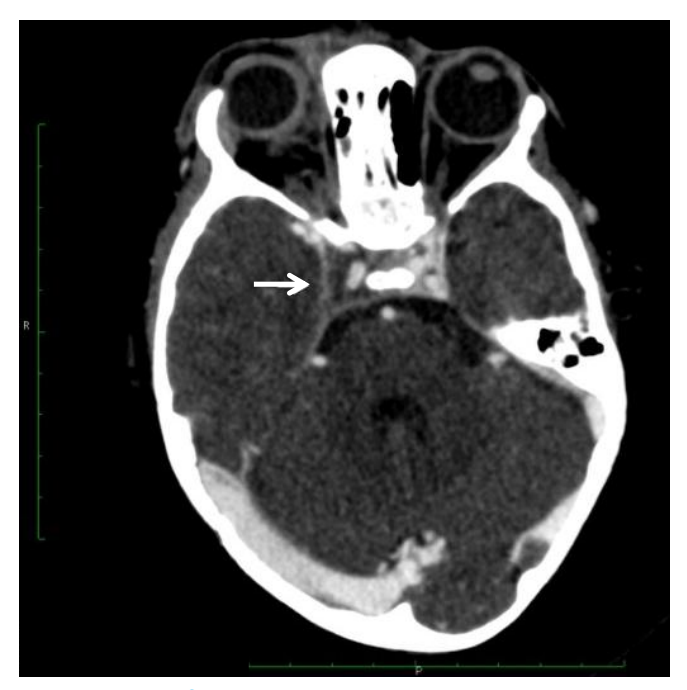
Fig. 1. Filling defect seen within the enlarged right cavernous sinus (arrow) with proptosis of right globe for patient 1.

A previously healthy 7-year-old boy was admitted