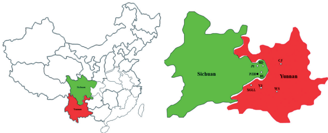
Figure 1. Ectomycorrhizosphere soil and ascocarp sampling sites in southwestern China. CJ: Chengjiang County; HD: Huidong County; HL: Huili County; JY: Jinyang County; WS: Weishan County; XGLL: Xianggelila County; VS: Yongsheng County.