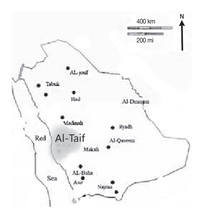
Fig. 1. Map of Al-Taif region in Saudi Arabia.

An approval of Institutional Review Board (IRB) at Al-Taif University and King Feisal General Hospital (RAC #207004) was declared before the initiation of the study. In addition, a written informed consent was obtained from each participant after a detailed explanation of the study's purpose, procedures, potential risks and benefits.