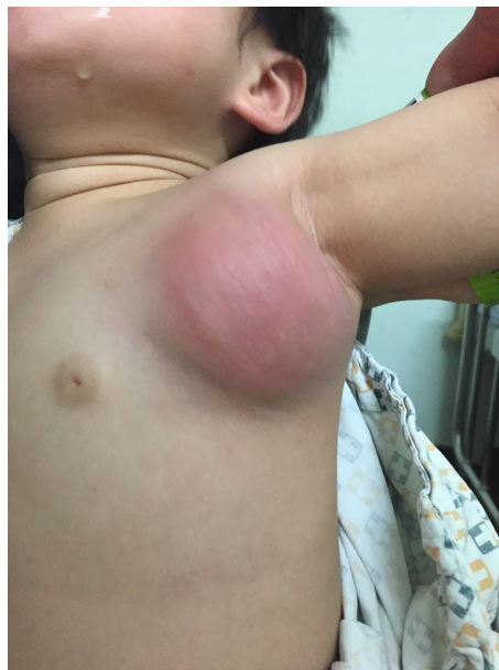
Fig. 1. A palpable mass of a 16-month old boy (patient 1). A red tender mass in the left axilla is about 8 cm in size.

A 16-month-old boy (patient 1) was admitted to the hospital through the outpatient clinic with fever and a palpable mass in the left axilla for 3 days. Multiple furuncles of size 1 cm or less on the waist and legs had been found from 1 month before the hospital visit, but were self-limiting. At the time of visiting hospital, the tender mass in the left axilla was red and about 8 cm in size ( Fig. 1 ). His blood pressure was 90/60 mmHg, pulse rate was 120 beats per minute, respiratory rate was 34 breaths per minute, temperature was 39.9°C, and he had experienced normal growth and development. Ultrasonographic examination of the mass revealed a hypoechoic, septate and complex lesion ( Fig. 2 , arrow). Ultrasound-guided needle