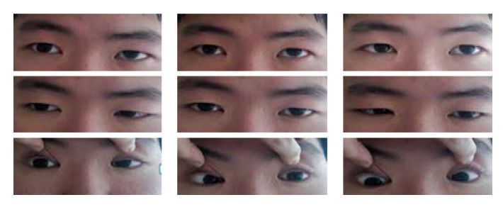
Fig. 2. Photographs of eye movement on 9 cardinal positions taken on October, 16, 2017.