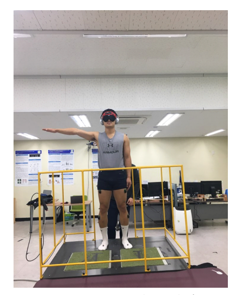
Fig. 3. Test using tilting platform.

Tilting platform was operated to left (target direction), right, forward, and backward by researcher. All participants were verified whether they were inclined by verbal or hand gesture (Fig. 3).