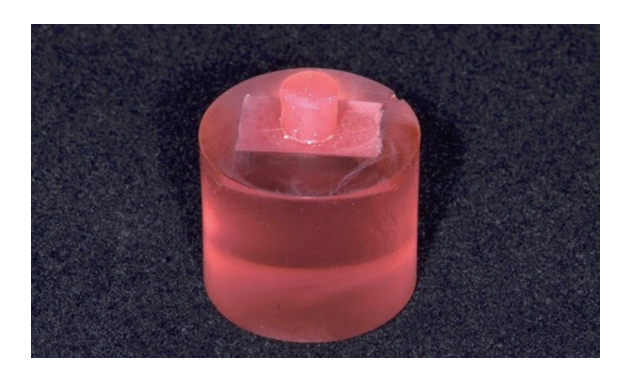
Fig. 1. Specimen for shear bond strength testing.