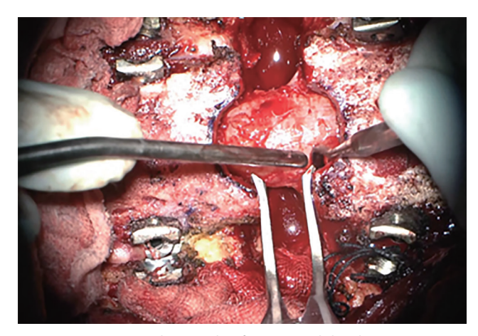
Fig. 2. Intraoperative photographs of revision pedicle subtraction osteotomy. Using a microscope, spine surgeon can perform spinal deformity surgery more safely.

functional spinal neurosurgery such as selective dorsal rhizotomy (SDR) because they learned about vascular, oncologic, functional, infectious, pediatric and trauma disease<sup>22,25,28,29)</sup>. Second, they are familiar with microscopic surgery and spinal cord surgery (Fig. 2)<sup>21,40)</sup>. Due to the fact that the spinal cord is essentially tethered in the canal by its confluence with the medulla oblongata and exiting nerve roots, the propensity for migration is limited once vertebral deformation develops. In the setting of a progressive kyphosis, the spinal cord will abut the posterior aspect of the vertebral bodies and disk spaces, eventually becoming draped over them if the curve becomes severe. Although the gradual nature of curve progression usually allows the spinal cord to adapt to its new position within the canal, sudden events, such as trauma or surgical correction of the deformity, can precipitate spinal cord injury. Spe-