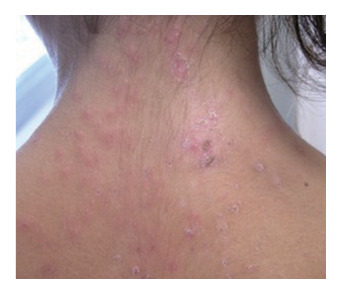
Fig. 1. Several isolated or confluent, roundish, erythematous papules, covered by scales, located on the nape, shoulders and upper portion of the back.