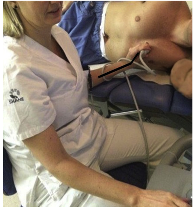
Fig. 1. Echocardiographic examination using Technique 1.

We investigated three different types of work tasks: echocardiography, other sonographic examinations (excluding echocardiography), and nonsonographic tasks. In echocardiography, the sonographer usually sits during the examination, maneuvering a transducer connected to the ultrasound machine by a cable in one hand, controlling the keyboard, integrated to the ultrasound machine, with the other hand, and at the same time, observing the images on a screen placed on top of the ultrasound machine. The sonographer applies pressure on the transducer with the hand to achieve optimal contact [20]. The sonographers in this study used one of three techniques, denoted T1 (10 participants), T2 (13 participants), and T3 (10 participants). In T1 the table was placed on the left side of the ultrasound machine, while in T2 and T3 the table was placed on the right side. In T1 the patient faced the examiner, who held the transducer in the left hand and handled the keyboard with the right hand (Fig. 1). In T2 the patient faced the examiner, who held the transducer in the right hand and handled the keyboard with the left hand (Fig. 2). In T3 the patient faced away from the examiner, who held the transducer in the right hand and handled the keyboard with the left hand (Fig. 3).