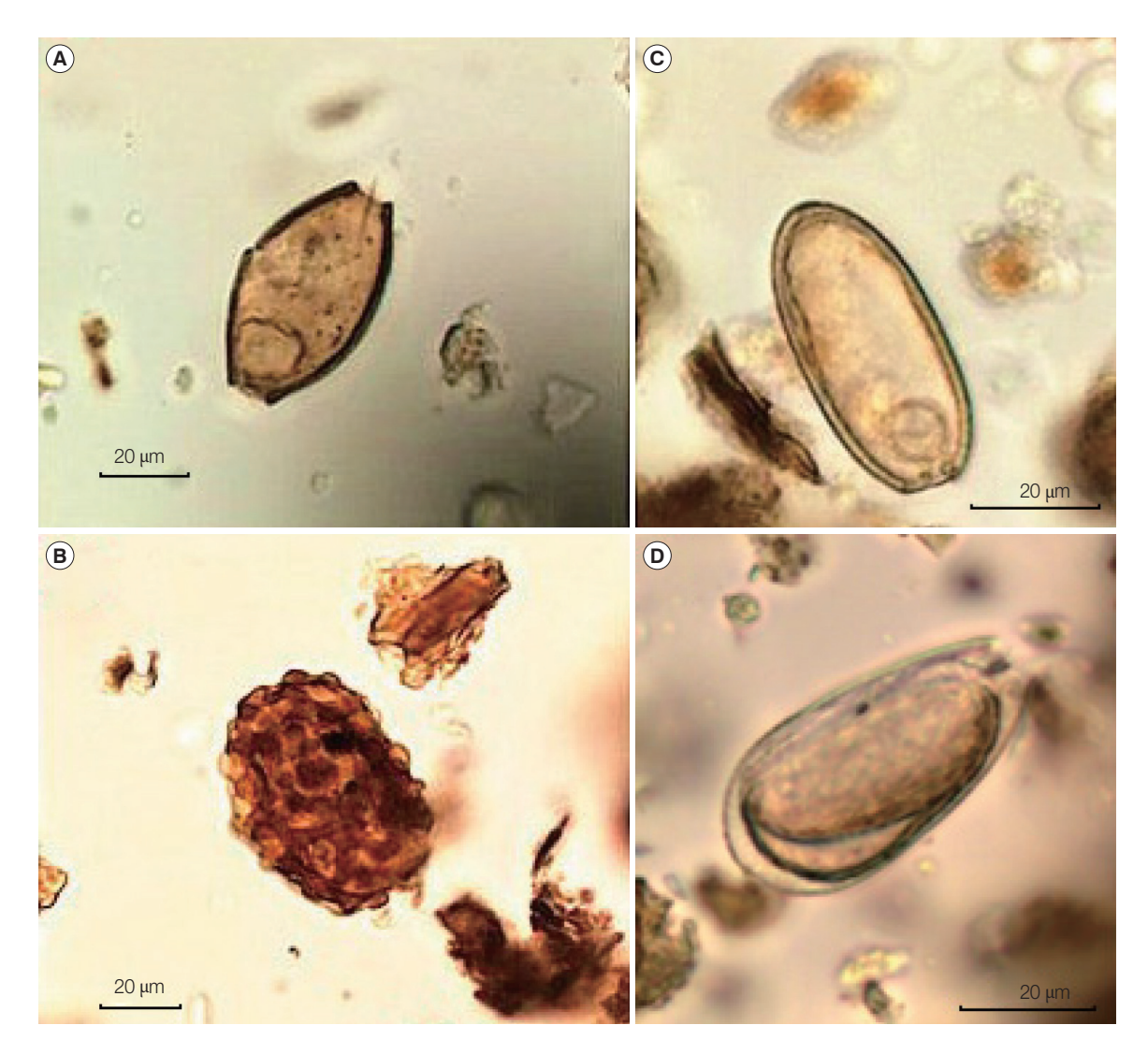
Fig. 2. Parasite eggs identified in the cesspool at the Japanese police outpost on the Batongguan Trail. Egg (A) whipworm; egg (B) roundworm; egg (C) Eurytrema sp. without embryo; egg (D) Eurytrema sp. with embryo.