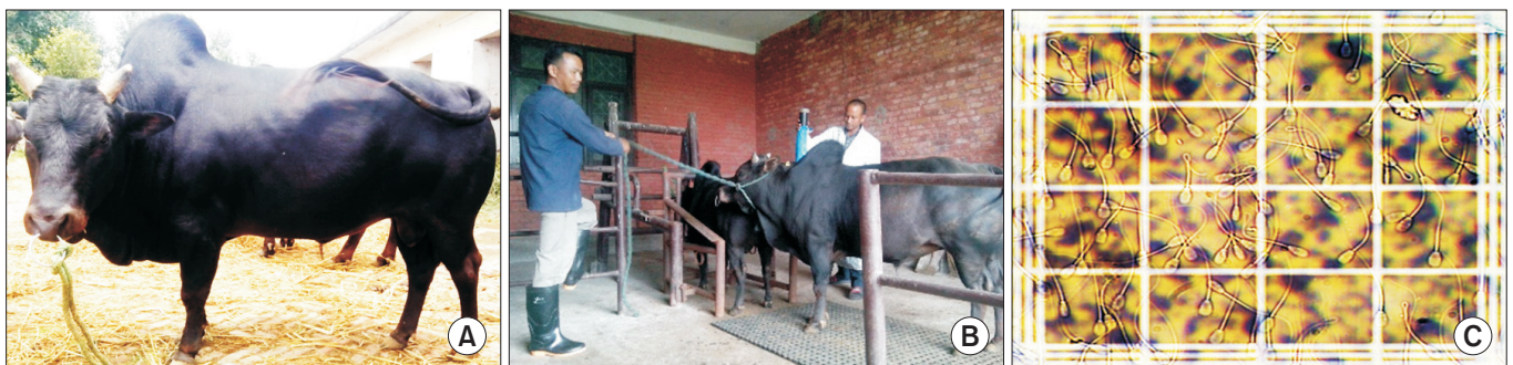
Fig. 1. Photograph of Achhami bull and semen collection. (A) Achhami bull. (B) Semen collection using AV. (C) Sperm concentration by haemocytometer (400 \times ).

After 6 months of acclimatization, bulls were started training for semen collection. Semen collection and evaluation was performed as described by Jha et al. (2013). Semen was collected twice a week using artificial vagina (AV) following two successive false mount (Fig. 1B). Soon after collection, the semen volume was recorded and colour was scored visually into 4 grades. The tube containing semen was maintained in water bath at 35°C. The mass activity was estimated by observing a drop (5 \mu L) of semen without using cover slip and scored into 4 grades under microscope (40 \times ). The sperm motility was estimated by observing a drop (5 \mu L) of semen using cover slip under microscope (100 \times ). The sperm concentration ( \times 10^6 cells/mL) was calculated using haemocytometer technique following the dilution rate at 1:100 (semen: buffered formol saline, Fig. 1C). Acrosome, mid-piece and tail of spermatozoa was examined by wet mount technique using buffered formol saline technique. Ten- \mu L of diluted formol saline fixed semen was placed on a microscopic slide and observed under microscope (1,000 \times ). Sperm head morphology was examined by William's staining technique. A thin and dried stained semen smear with carbol fuchsin