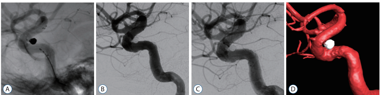
Fig. 2. Illustrated case of a paraclinoid aneurysm. A : To stabilize the catheter, a Solitaire AB 5×20 mm stent is deployed covering the neck of the aneurysm. Subsequent coil deployment is performed easily. B : After completion of coil packing in the aneurysm, the stent is recaptured and removed. C : First angiographic follow-up at 2 years shows complete and stable packing of the aneurysm. D : Second angiographic follow-up at 4 years demonstrates complete exclusion of the aneurysm out of the blood circulation.