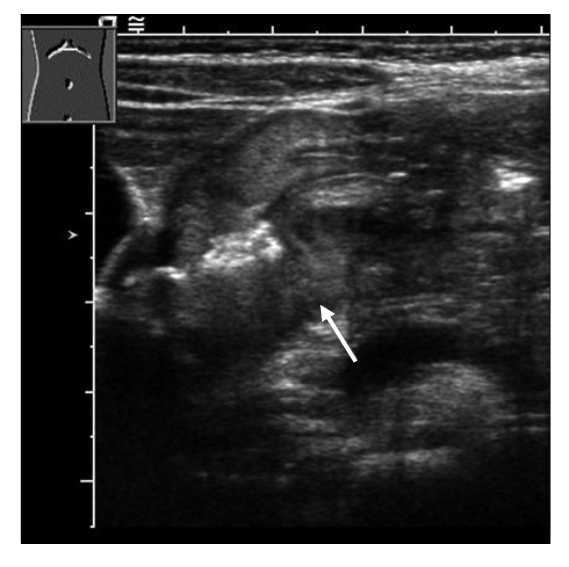
Fig. 2. Transverse gray scale sonogram through the duodenal bulb demonstrating hyperechoic center surrounded by a hypoechoic halo with various thicknesses (arrow).

Values are presented as number (%). Mean age, 10.6\pm4.5 (range, 3.0-17.9) years.