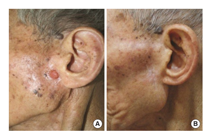
Fig. 3. (A) Preoperative photograph of an 85-year-old man with a polypoid mass on the left preauricular region, measuring 1 cm in diameter. (B) At postoperative 14 months, the patient showed no sign of local recurrence, without significant complications.

mission was confirmed by positron emission tomographycomputed tomography) (Fig. 2). There was no recurrence or metastasis during the follow-up period of 14 months (Fig. 3).