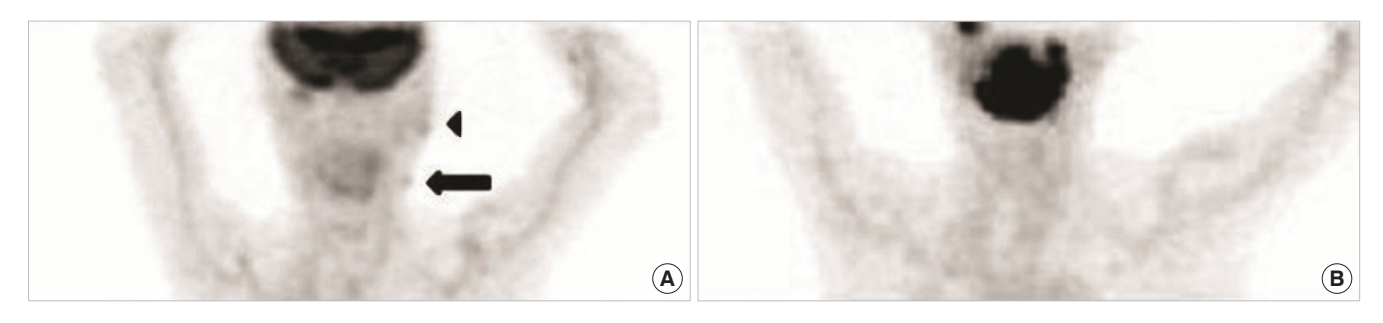
Fig. 2. Positron emission tomography-computed tomography findings. (A) At postoperative 3 months, diffuse increase of metabolism (arrowhead) on outer margin of left parotid gland and mild increase of metabolism on small nodule of left upper neck (arrow) were seen, indicating low grade malignancy in left parotid gland and regional lymph node of ipsilateral upper neck. (B) After radiation therapy for 3 months, decrease of hypermetabolic lesions were observed, as in metabolic remission state.