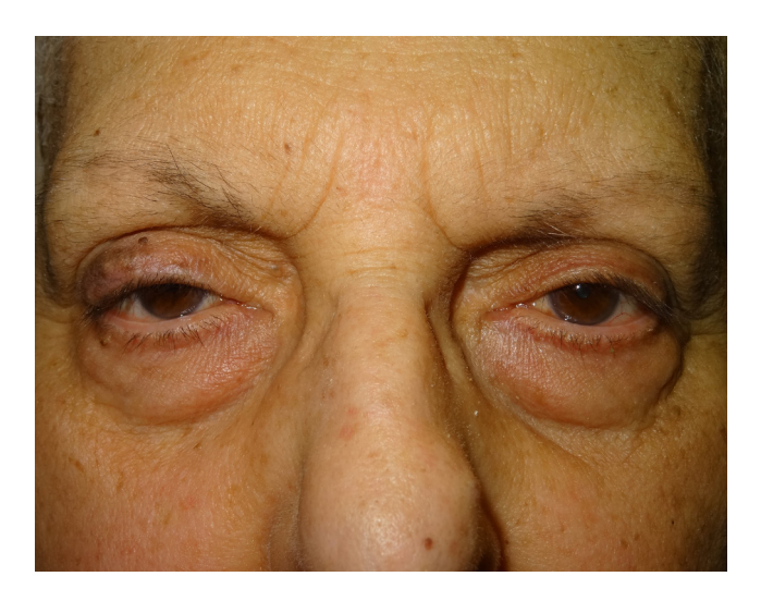
Fig. 5. Patient's photograph 1 month after chemotherapy.