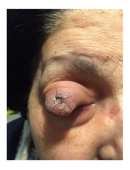
Fig. 4. Patient's photograph at nearly 15 days follow-up showing further regression of the tumor mass.