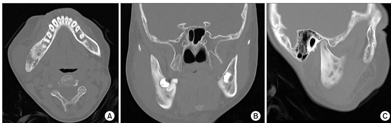
Fig. 2. Representative computed tomographic views of chronic recurrent multifocal osteomyelitis in jaw case showing the lesion in the right mandible, axial (A), coronal (B), and sagittal (C).

The pathophysiological understanding of sporadic CNO/CRMO is less known as the imbalance between proinflammatory and antiinflammatory cytokines, of which the mechanisms are known to govern the cell and receptor-specific induction of cytokines and chemokines 22,23 . Monocytes from CRMO patients fail to express the immune regulatory IL-10 in response to Toll-like receptor (TLR) 4 stimulation with lipopolysaccharide. Impaired IL-10 expression is partially caused by the reduced activation of mitogen-activated protein kinases (MAPK) and extracellular signal regulated kinase (ERK) 1, resulting in impaired activation and nuclear shuttling of the transcription factor signaling protein (SP) 1 and subsequent altered recruitment of Sp-1 to the IL-10 promoter 24,25 .