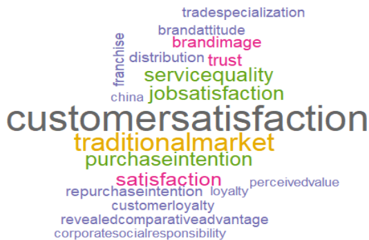
Figure 1: Word Cloud for Keywords

The results of the word frequency analysis and the word clouding for the papers published in the JDS are shown in <Figure 1> and <Table 2>.