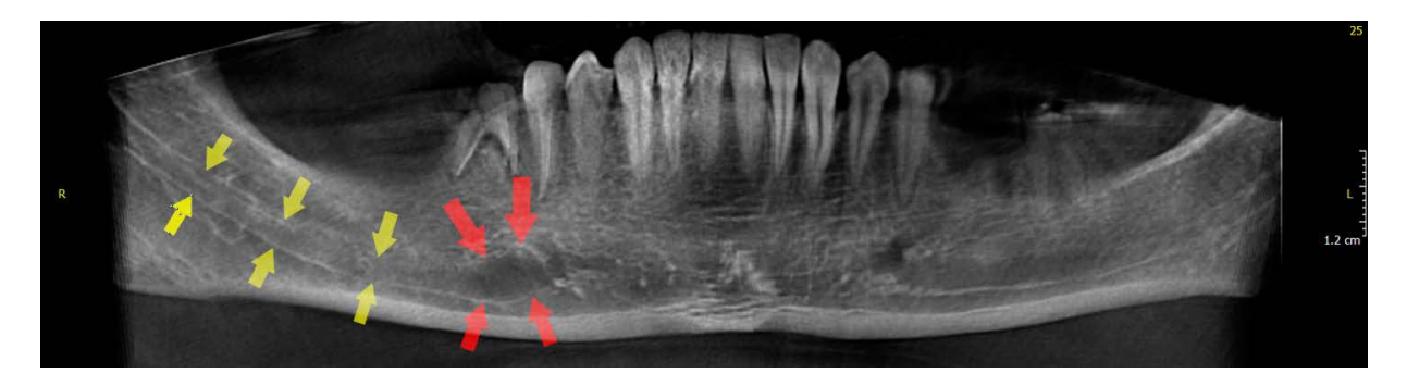
Fig. 4. A panoramic reconstructed cone-beam computed tomographic image shows mandibular canal widening in a patient with neurofibroma (arrows show the normal canal and mandibular canal widening).