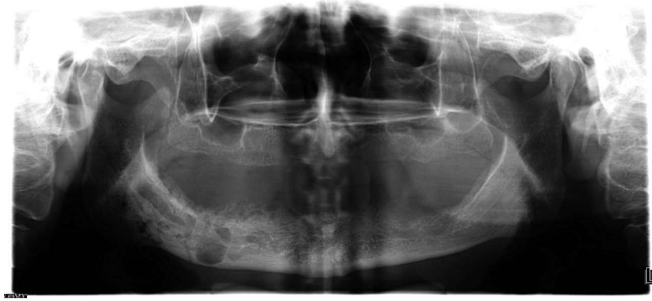
Fig. 5. A panoramic image shows mandibular canal widening in a patient with central hemangioma.

was unilateral in over 50% of the affected patients. Canal enlargement varied from a slight widening to a 2-fold increase in canal diameter. The alveolar canal was undetectable in around 2% of the patients, and the mandibular canal had an irregular border in the majority of cases. According to Vartiainen et al.,<sup>18</sup> involvement of the alveolar nerve in neurofibromas can lead to development of a fusiform, tubelike, round or ovoid widening of the mandibular canal.