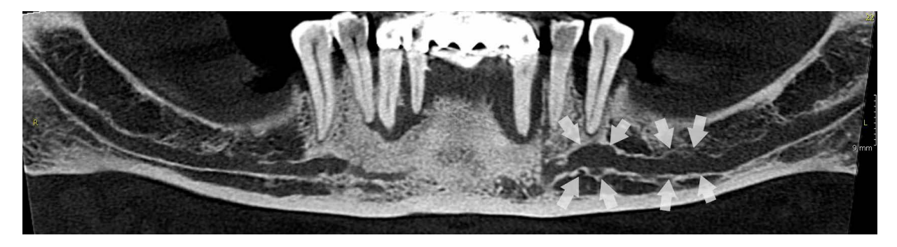
Fig. 3. A panoramic reconstructed cone-beam computed tomographic image shows mandibular canal widening in a patient with schwannoma.