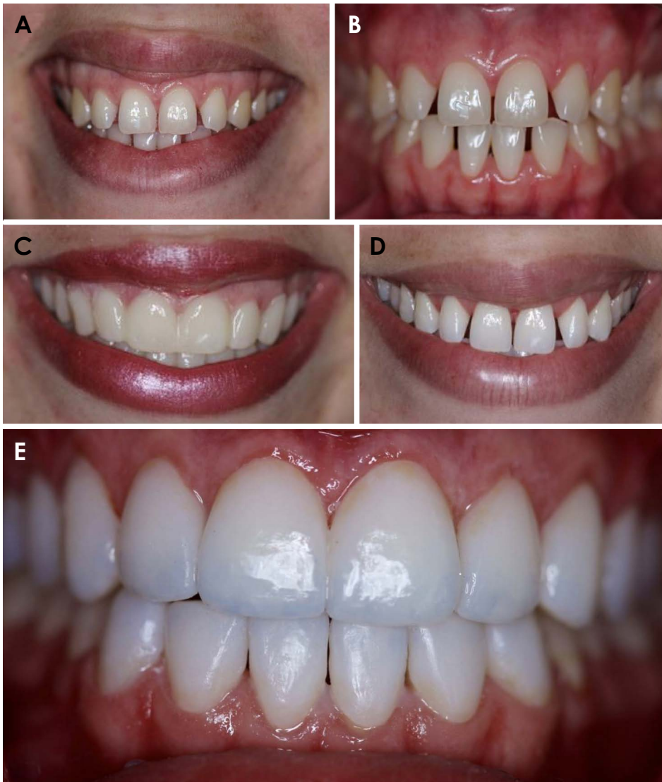
Fig. 1. Clinical photographs of the patient. Extraoral (A) and intraoral (B) photographs show the presence of yellowish teeth, generalized anterior diastema, and a gummy smile. C. Mock-up placed on teeth for the clinical simulation of the treatment outcome. The treatment consisted of periodontal plastic surgery, tooth whitening, and cementation of ceramic veneers. D. View of the patient's smile after periodontal plastic surgery and tooth whitening. E. Immediate clinical view after the cementation of the veneers.

performed with visual inspection and radiographic examinations, which may hinder the evaluation of treatment success. 14 This report describes the use of OCT as a noninvasive diagnostic and follow-up method for evaluating gingival recovery and the adhesive interface of ceramic laminate veneers.