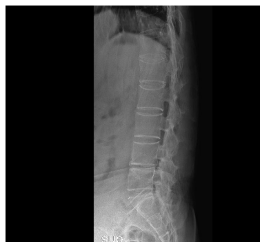
Fig. 2. L-S spine lateral (2018.11.26).