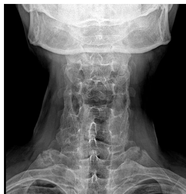
Fig. 4. C-spine anterior posterior (2018.11.26).