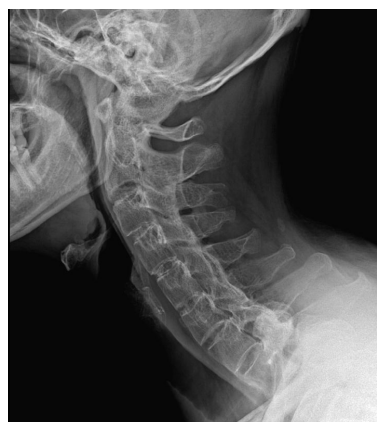
Fig. 3. C-spine lateral (2018.11.26).