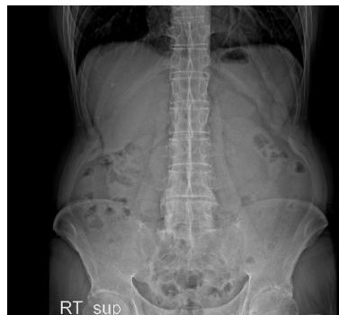
Fig. 1. L-S Spine anterior posterior (2018.11.26).

Before performing acupotomy, the practitioner asked the Family